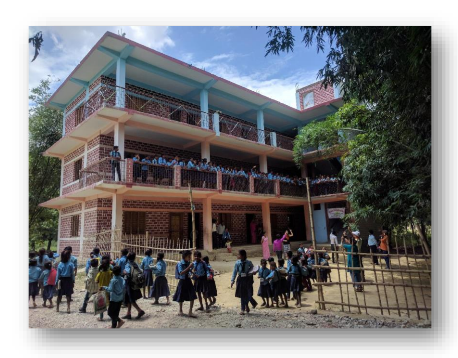
The Hoste Hainse Padariya School, Sarlahi

Hoste Hainse firmly believes that education empowers people, and this is especially important when people are misrepresented in the decisions that affect them. In seeking to educate the underprivileged and low-caste students, Hoste Hainse hopes to ignite a social reform where people are recognized and given equal opportunities regardless of their caste. This has already started, which can be seen with the positive rate of development in the Sarlahi district.