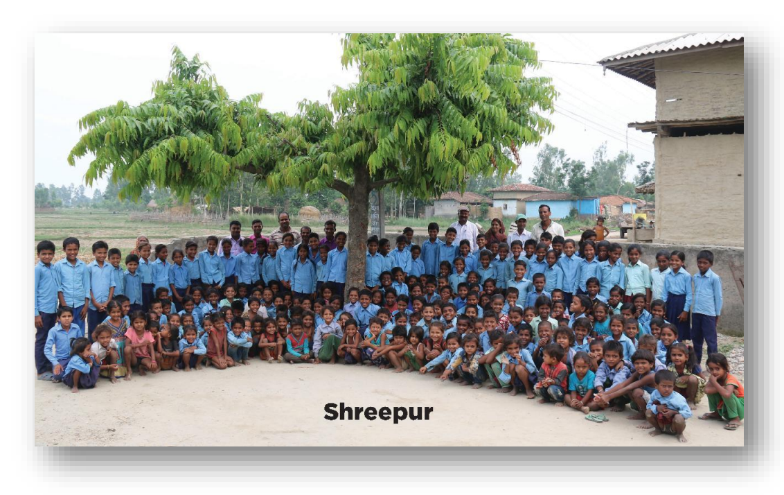
The Hoste Hainse Shreepur School, Sarlahi

Hoste Hainse is engaged in various education programs in four localities, known as VDC's (Village Development Committees), of Sarlahi, namely Dhangada , Sahodwa , Shreepur and Padariya , and touch the lives of over 2,000 underprivileged children. These education programs entail not only the operation of schools, but also income-generation programs, such as fish farming and milk delivery, in an attempt to make the schools self-sustainable, as well as increase the livelihood of the inhabitants from the localities. The schools are set up in a non-profit free-for-all manner for the education of marginalized and needy children, while the income-generation programs are run with the people of the localities in mind, with a preference to the parents of children enrolled in the Hoste Hainse schools.